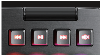
Volume Scroll Wheel & Multimedia Keys: Dedicated volume wheel and media keys