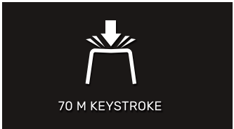
Sturdy, Reliable Kailh Speed Mechanical Switch