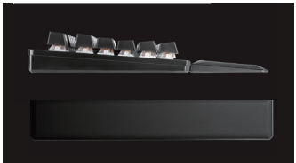
Magnetic Approach Palm Rest